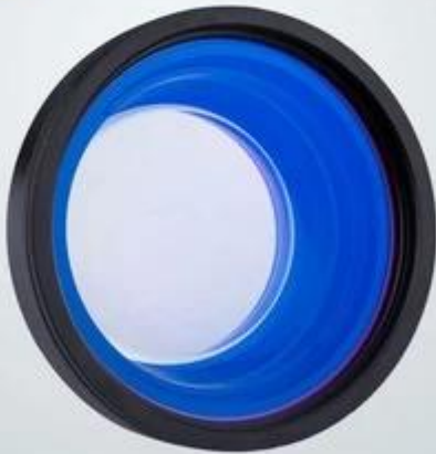
355nm/532nm/1064nm F-theta Lens