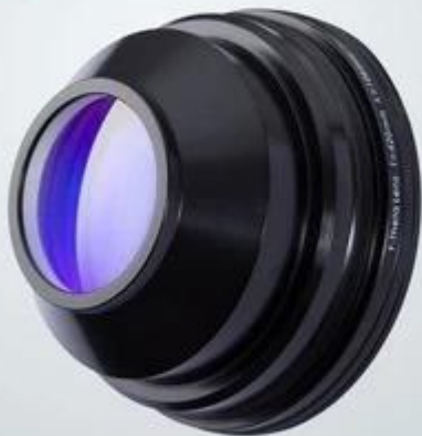
355nm/532nm/1064nm F-theta Lens