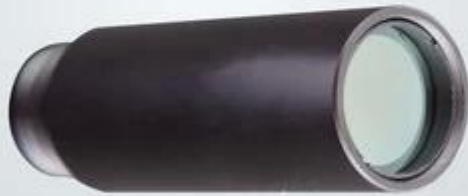
532nm Beam Expander