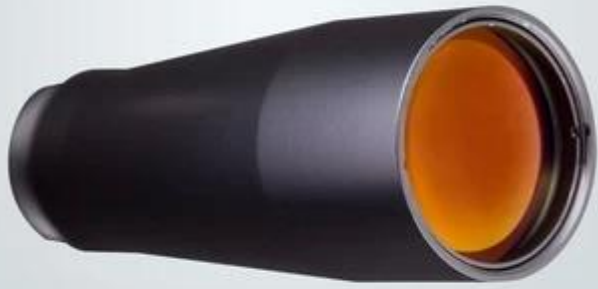
532nm Beam Expander