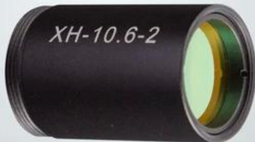
CO2 beam expander