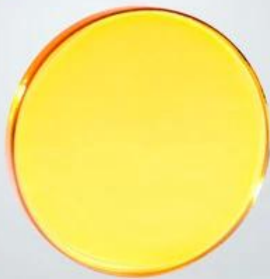
● CO2 Beam Combiner ●