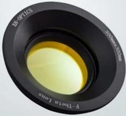
CO2 F-theta Lens