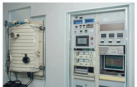
Carmanhaas Coating Machine