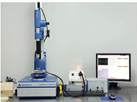
TRIOPTICS OptiSpheric 2000 AF ---Testing EFL. R. Centering Error. Wedge Angle. BFL. MTF