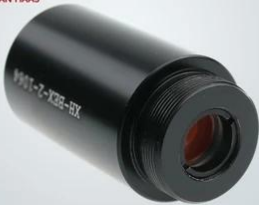
YAG Beam Expander