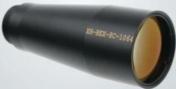
YAG Beam Expander