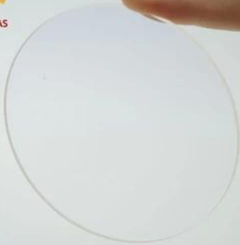
YAG Protective Window