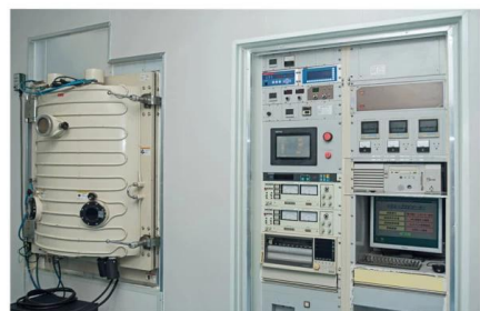
Carmanhaas Coating Machine