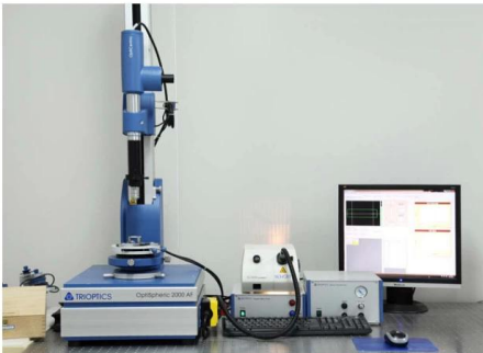
TRIOPTICS OptiSpheric 2000 AF ---Testing EFL、R、Centering Error、Wedge Angle、BFL、MTF