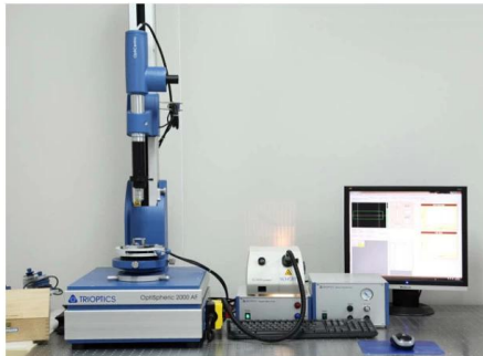
TRIOPTICS OptiSpheric 2000 AF ---Testing EFL、R、Centering Error、Wedge Angle、BFL、MTF