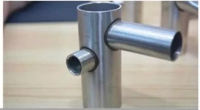
360 degree no dead seam weld