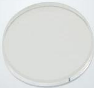
● YAG Beam Combiner ●