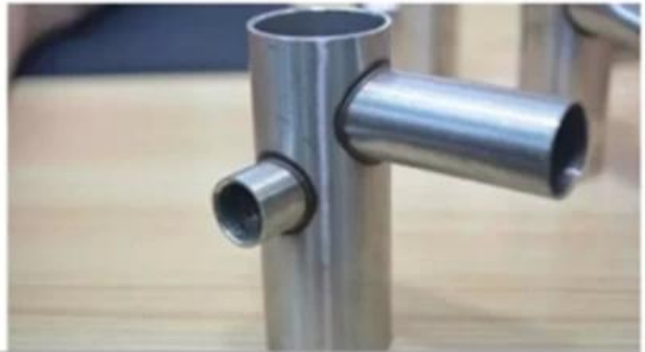
360 degree no dead seam weld