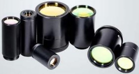
CO2 Beam Expander