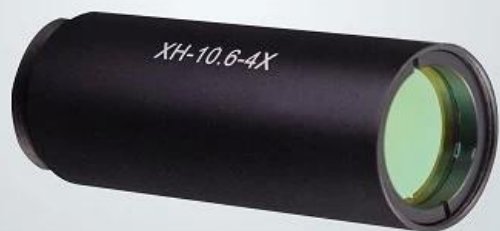
CO2 beam expander