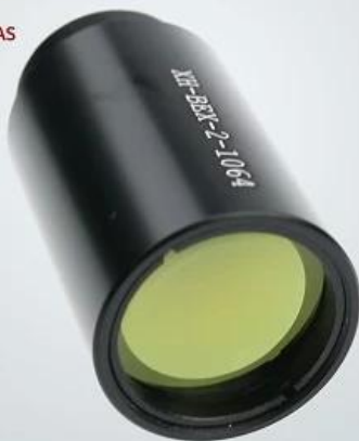
YAG Beam Expander