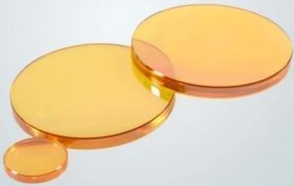
● CO2 Protective Window ●