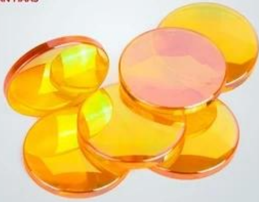
CO2 Focus Lens