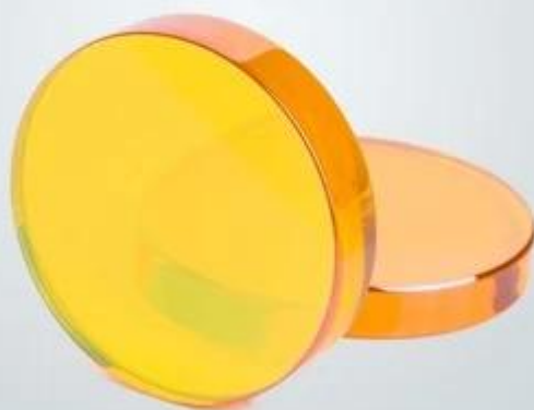
CO2 Focus Lens