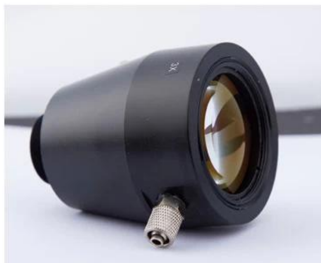
Ống kính Làm sạch