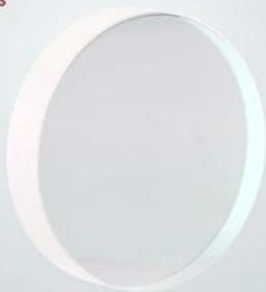
● YAG Beam Combiner ●